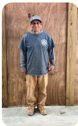
Cruz Construction Team Leader